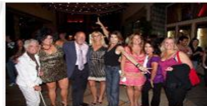
Funniest Housewives of Orange County cast shares a moment after a recent show at the Improve Comedy Club Irvine Spectrum Center with audience members from "The Real Housewives of Orange County" cast, Vicki Gunvalson (middle) and Jeana Keough, (third from right).

Tickets for the Funniest Housewives of Orange County is $25. Doors open at 7 p.m. for dinner and preferred seating. Call 949.854.5455, and whatever you do, don't miss The Funniest Housewives in Orange County's Website at www.funniesthousewives.com . It's hilarious.